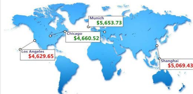
World Scrap Map